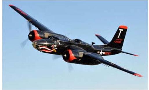
Douglas A-26 "Invader"