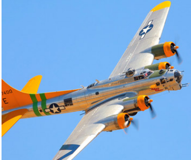
Boeing B-17 "Flying Fortress"